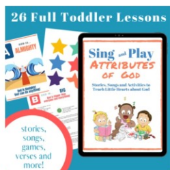
The Ultimate Toddler Bundle: Everything you need to teach age 1-3 about God