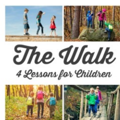
"The Walk" 4 Week Study on Following Jesus $29 $45