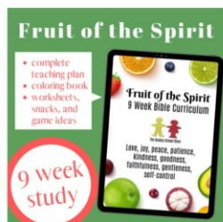
"The Fruit of the Spirit" 9 Unit Curriculum for Kids $57 $90