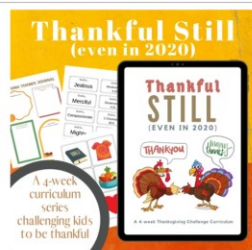
Thankful Still (even in 2020) 4-Week Sunday School Curriculum $45

If your church buys resources, please consider using The Sunday School Store . Church budgets are tight. That's why our digital curriculum is half the cost of printed material. Even when finances are limited, your teaching can make an eternal difference.