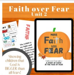
More FAITH Less FEAR: 4-Week Children's Ministry Curriculum (Unit 2 of Faith over Fear) $45