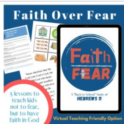
"Faith Over Fear" 5 Lesson Unit for Back-To-School from Hebrews 11 $55