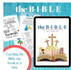
The BIBLE Unit 1: Genesis to Ezra (13 Week Curriculum) from $97 $125